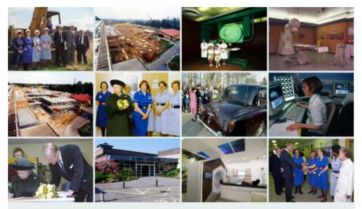
Celebrating 25 years of St Luke's Cancer Centre at Royal Surrey