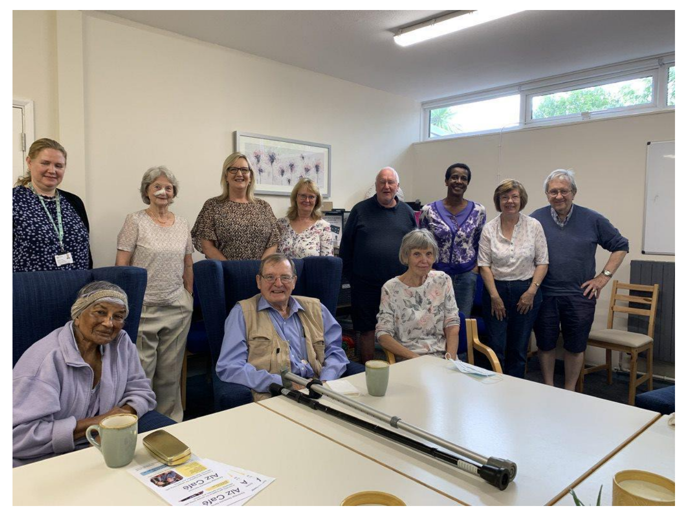
Carers Support Group, Thames Ditton Centre for the Community

• "One thing that I find useful is an automatic pill box from Amazon. I fill it up but it opens at 8 and at 5 every day so that my mum can take her tablets. It bleeps and it flashes at her and we have found that very, very useful. Although the chemist supply their blister packs, my mum was just puncturing all the holes and all the tablets were falling out and it was all totally mixed up."