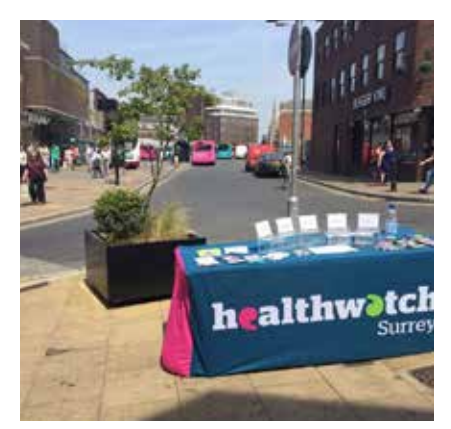
21st June, Guildford North St

We trained our group of Surrey Heath volunteers so they can carry out engagement events in the future.