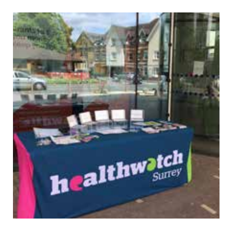
16th June, Runnymede Council offices

Prompted by experiences shared with us, we carried out two reactive engagement events at Chobham and West End Practice and South Park GP Surgery.