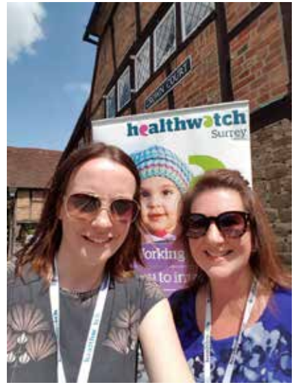
24th May, Godalming High St

The 22 experiences shared with us and the insight gained prompted Healthwatch Surrey to write to the commissioners of the services about how patients and public had been engaged in the proposed service change. We will continue to monitor this situation closely.