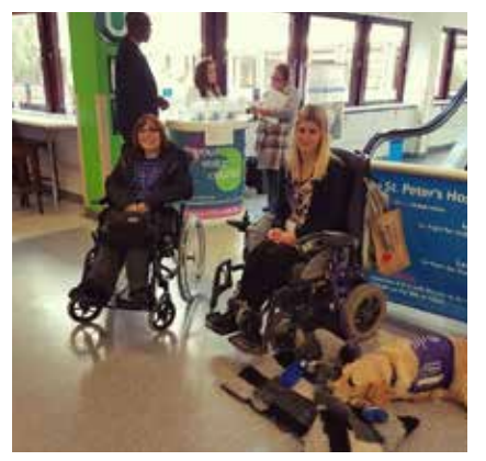
26th April, St Peter's Hospital

We held 24 events across Surrey as part of our listening tour. This included district and community hospitals, hubs, council offices and high streets from which we heard more than 300 experiences.